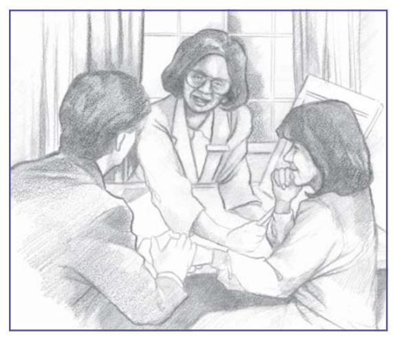
The doctor will ask about medical history.

To diagnose diverticular disease, the doctor asks about medical history, does a physical exam, and may perform one or more diagnostic tests. Because most people do not have symptoms, diverticulosis is often found through tests ordered for another ailment.